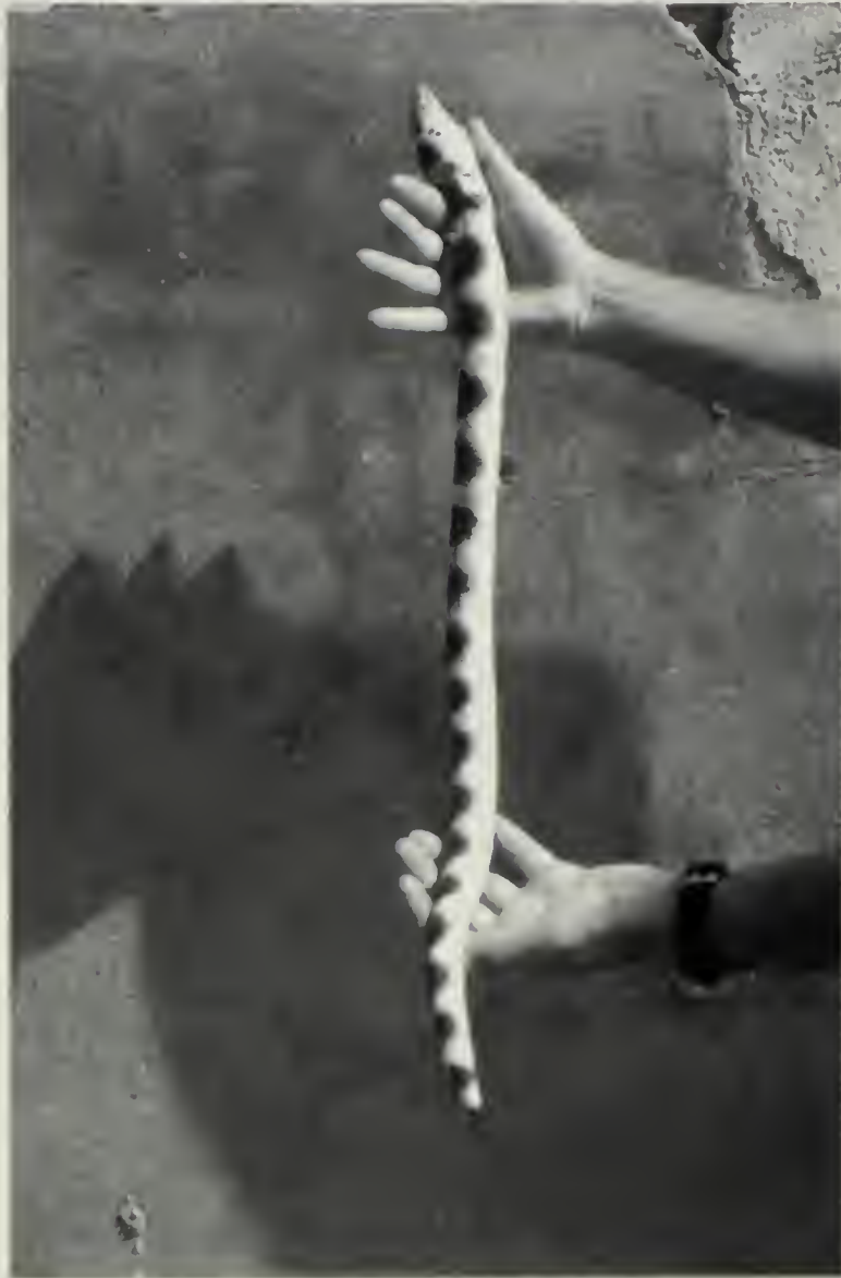
Fig. 1 - Specimen of Pisodonophis semicinctus captured at Capo Scalambri, Punta Secca, Ragusa, Sicily (12 July 1997). Total length: 705 mm.

Rhône, France, on November 20, 1980. Our research group is presently investigating and monitoring captures of unusual or rare fish species by fishermen along the coasts of Sicily. As a matter of fact this island occupies a central geographical position between the eastern and the western Mediterranean basins, so that the occurrence of lessepsian or Atlantic species in its waters is possible. We recently published a series of observations to this effect (Catalano et alii , 1985; Catalano & Zava, 1993; Catalano et alii , 1998).